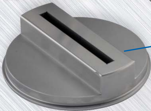
Close to clamps stripper plate