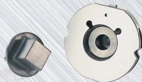
0-40 Punch Holder